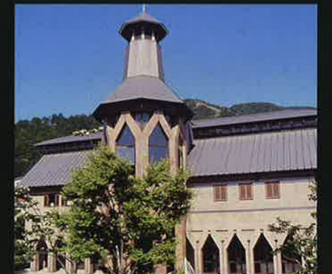
Tatsuyuki Takano museum