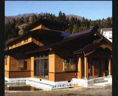
Asagama Hot Springs Park [Furusato-no Yu]