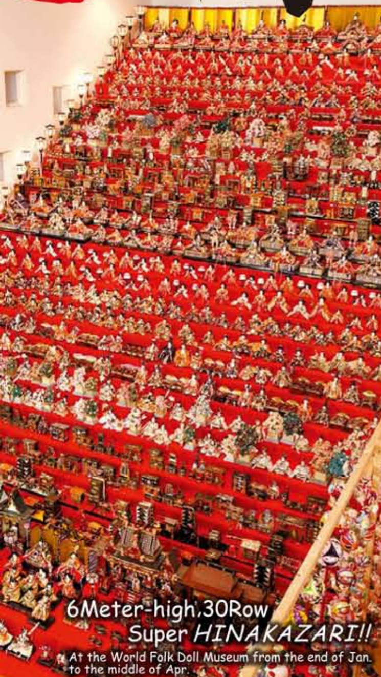
6 Meter-high, 30 Row Super HINAKAZARI!! At the World Folk Doll Museum from the end of Jan. to the middle of Apr.